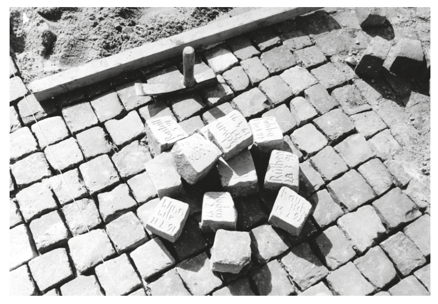
Jochen Gerz, 2146 Steine – Mahnmal gegen Rassismus / Das unsichtbare Mahnmal (2146 Stones – Monument against Racism / The Invisible Monument), 1993, Saarbrücken